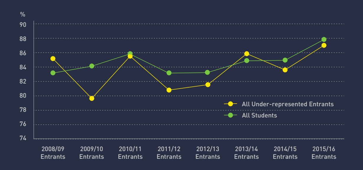
FIGURE 3 - UNDERGRADUATE NON-COMPLETION RATE 2